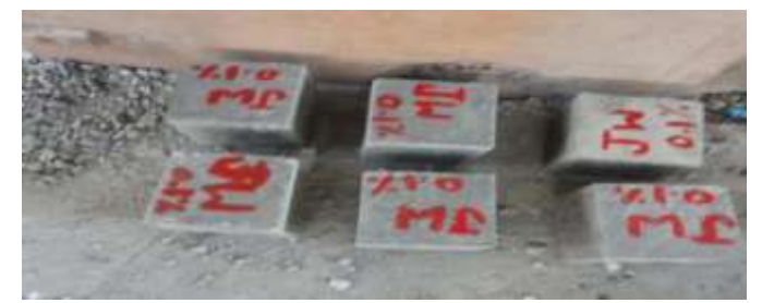
Fig: 4 Casted cube specimens.