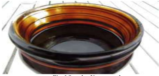
Fig: 1 Sample of jaggery molasses

Two different sets of specimens are prepared using design mix in the first set, the specimen are casted by varying percentage of replacement of cement by Rice husk ash starting from 0 to 25% with increment of 5% by weight of cement and they represented as 5%, 10%, 15%, 20% respectively. In second set the former procedure is followed, I have selected one of the above sample which give the optimum strength and then vary the sugar molasses at 0.40%, 0.80%, 1.20%, 1.60%, 2.0% by weight of material is added they are designated as cubes with size 150mm X 150mmX 150mm, are prepared. The cube are demoulded after 24 hours from casting and kept in the water tank for 28 days.