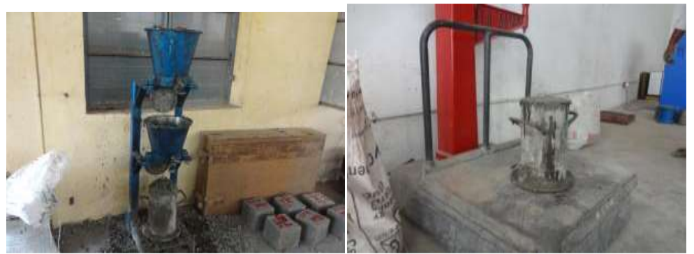
Fig:3 Compaction factor apparatus and weighing of partially weighed concrete