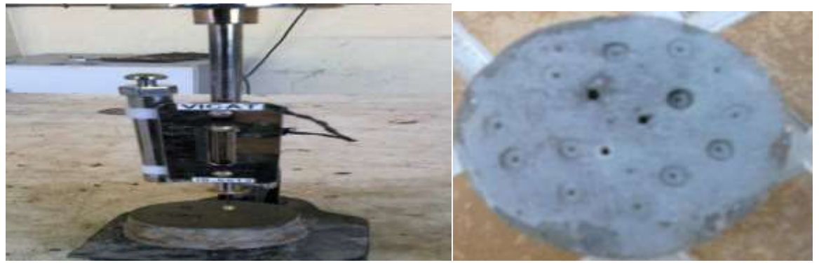
Fig.6Test for setting time of cement

Consistency of plain cement paste is to know that the 36.00%. Based on this consistency value, initial and Final setting time were cal.For plain cement as per IS 4031-1989. Initial and final setting time of cement is 25 min and 7hr 40min respectively. The same test repeated after 0.2, 0.4, 0.6, 0.8 and 1.0 percentage of molasses added to cement by its weight. At each time the setting time gradually get increased. The following table shows the effect of molasses on setting time of concrete.