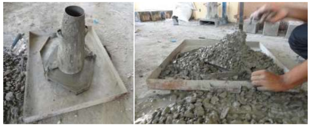
Fig: 2 Slump cone and collapse of concrete after lifting.

The workability of the fresh concrete is a composite property. IS: 6461 (Part-VII) - 1976 defines workability as the property of freshly mixed concrete which determines the ease and homogeneity with which it can be mixed, placed, compacted and finished. According to the IS 1199-1960, workability of fresh concrete has been performed. Workability of concrete can also depend on the type structure, thickness of structural and place of casting.