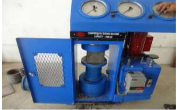
Fig: 5Testing of cube specimen.